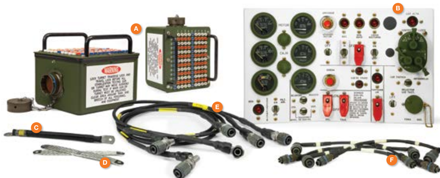
A. Stryker Vehicle - break-out boxes. B. Control panel for foreign defense vehicle. C. Abrams Tank - 4/0 battery cable. D. 1/0 HUMVEE - AWG ground strap. E. Abrams Tank - cable assemblies. F. Cable assemblies for use in armored vehicles.